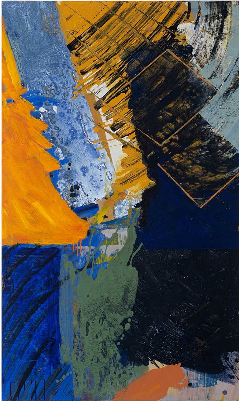
Allie McGhee Angle of Reflection 2019 Acrylic on canvas 60h x 36w in