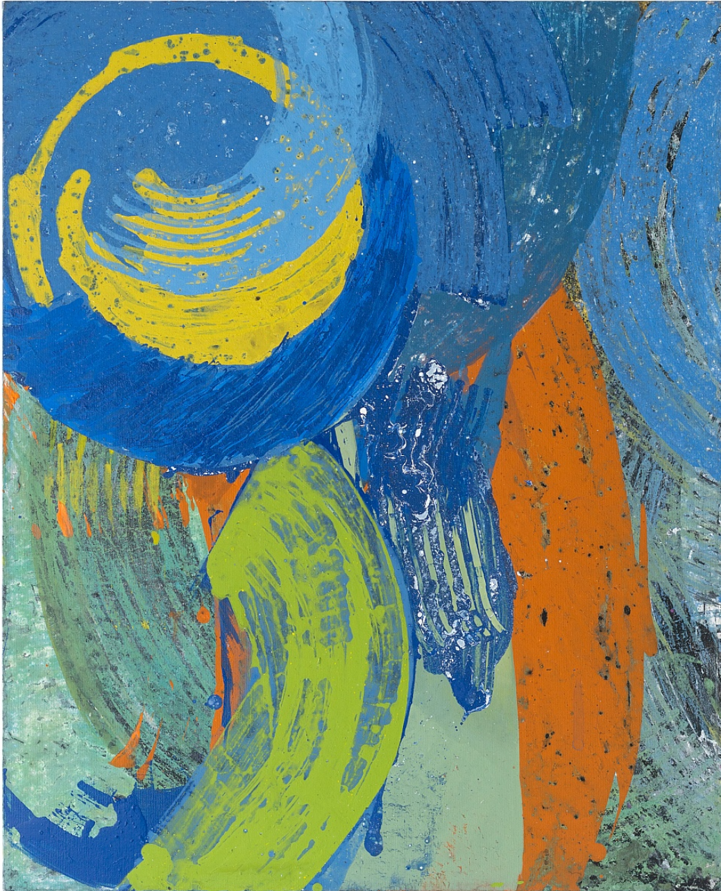
Allie McGhee In the Garden 2005 Acrylic and enamel on canvas 30h x 24w in