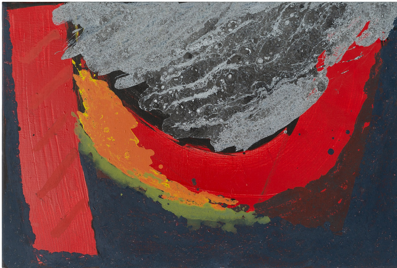
Allie McGhee Banana Red 2020 Acrylic and enamel on canvas 20h x 30w in