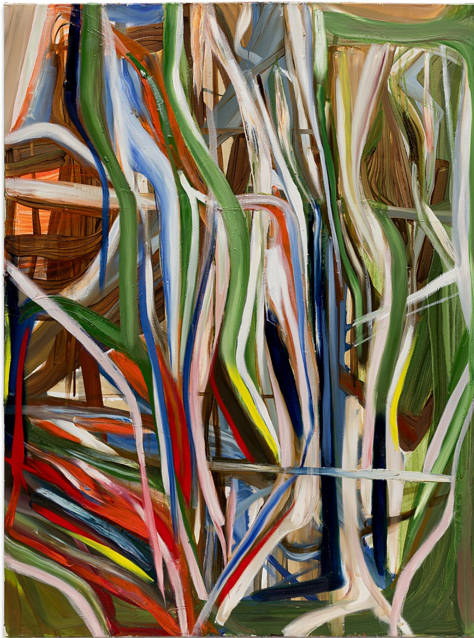
Tanya Ling Lupus (Wolf) HABA 2022 Oil on canvas 48h x 36w in