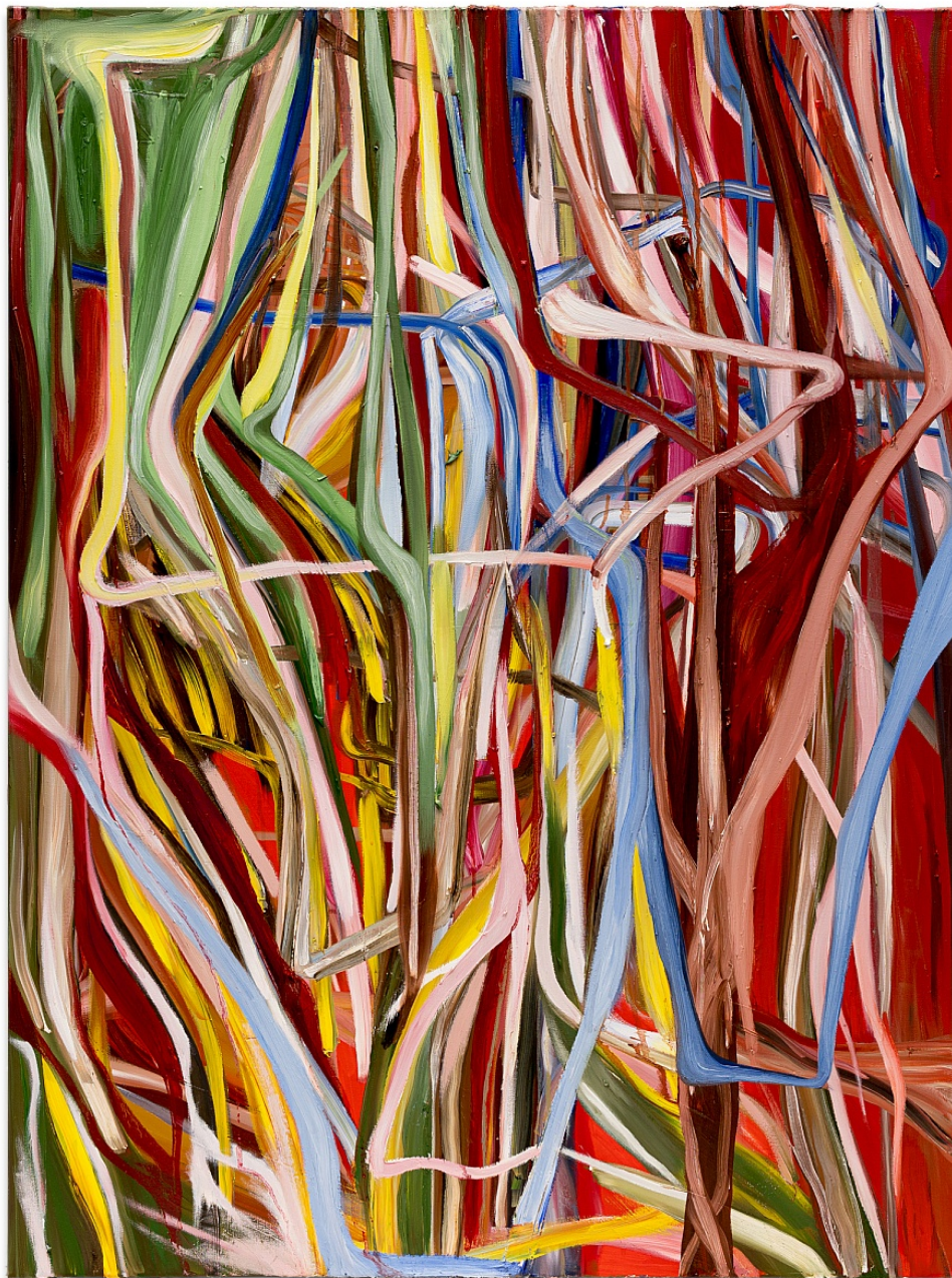
Tanya Ling Caelum (Graving Tool) HABA 2022 Oil on canvas 48h x 36w in