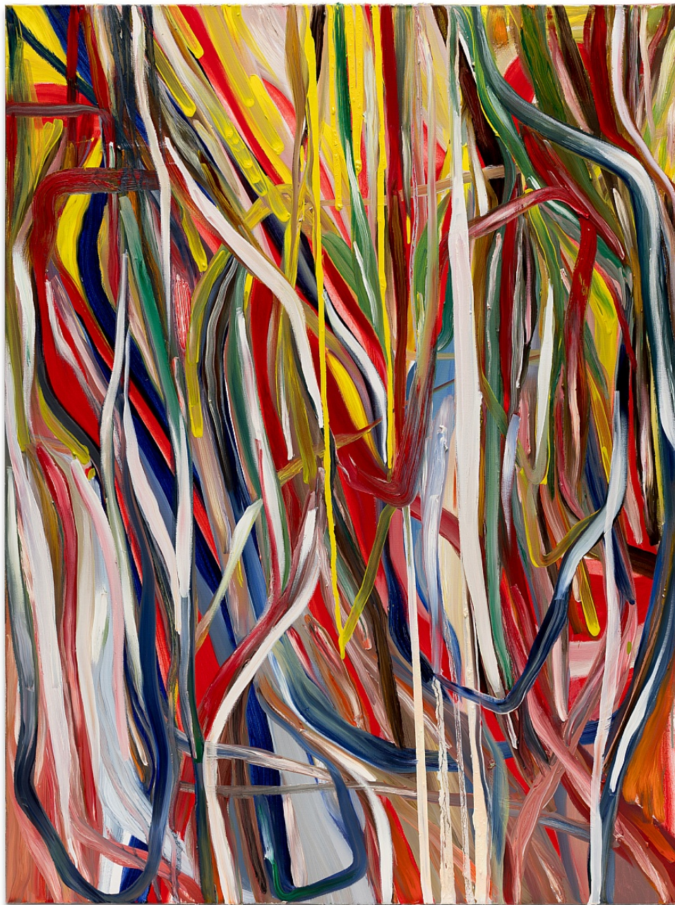
Tanya Ling Microscopium (Microscope) HABA 2022 Oil on canvas 48h x 36w in