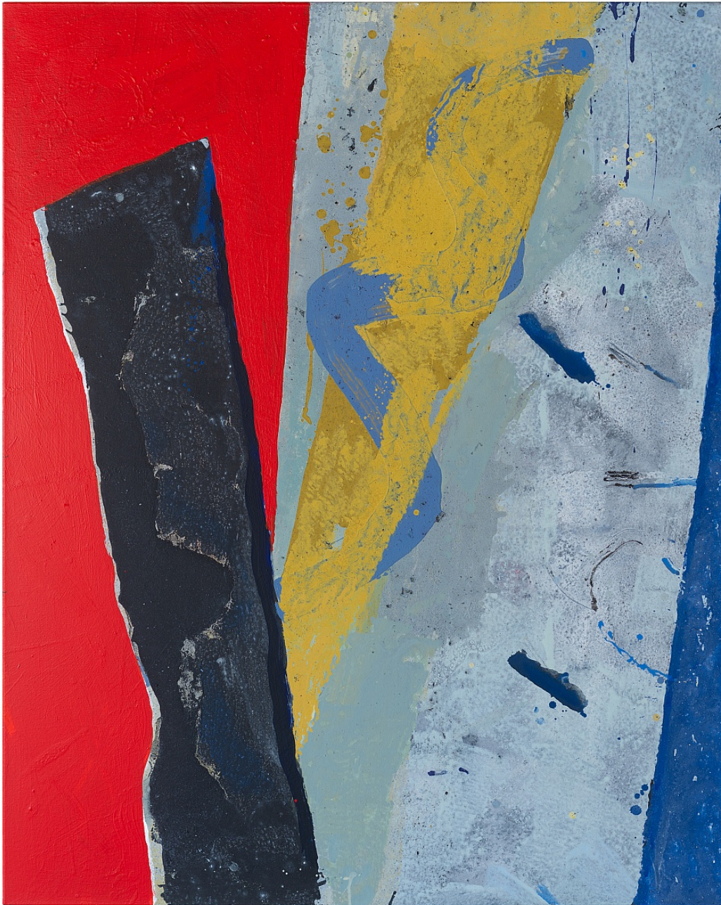
Allie McGhee Diagonal Black 2021 Acrylic and enamel on canvas 60h x 48w in