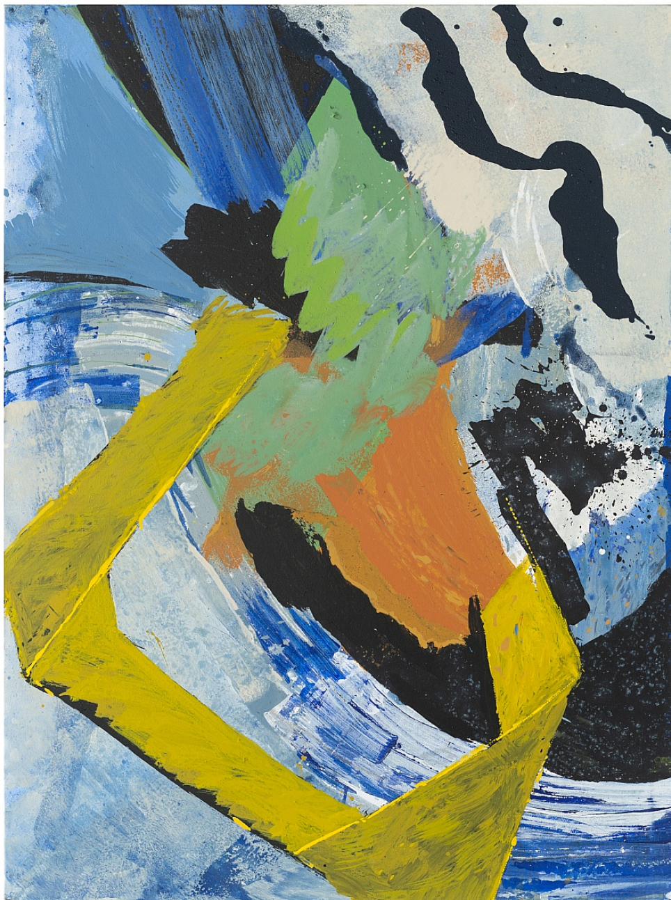
Allie McGhee Consecutive Seconds 2022 Acrylic and enamel on canvas 48h x 36w in