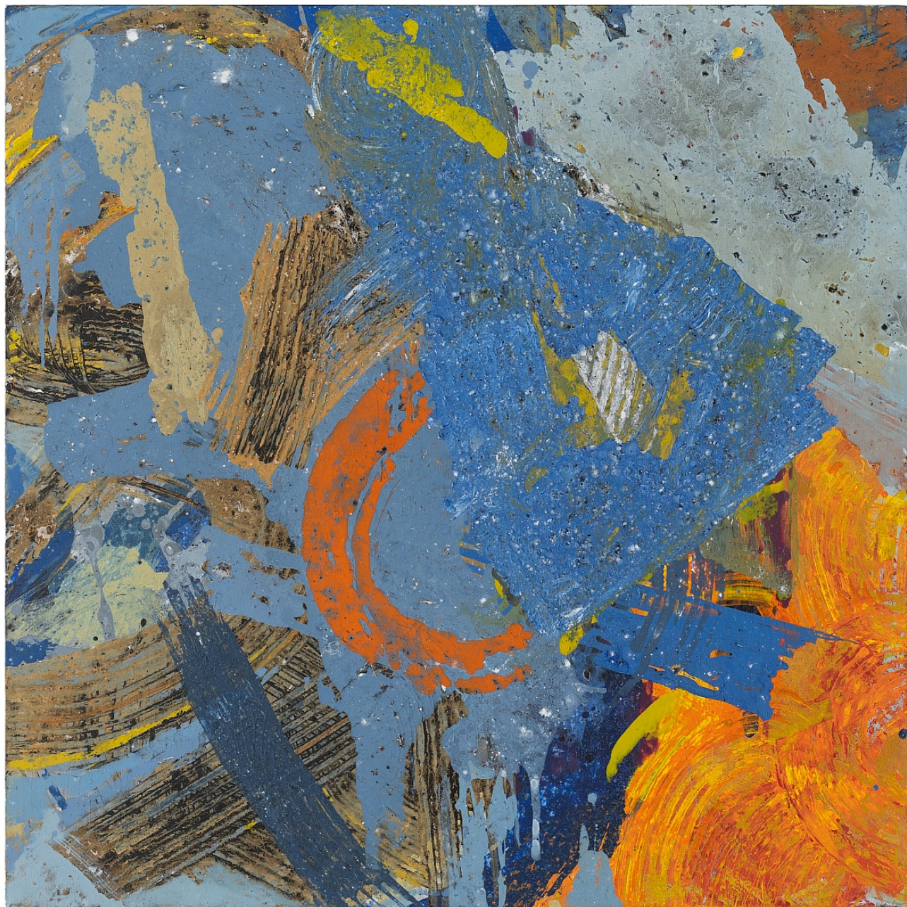
Allie McGhee Falling Sky 2000 Acrylic and enamel on canvas 36h x 36w in