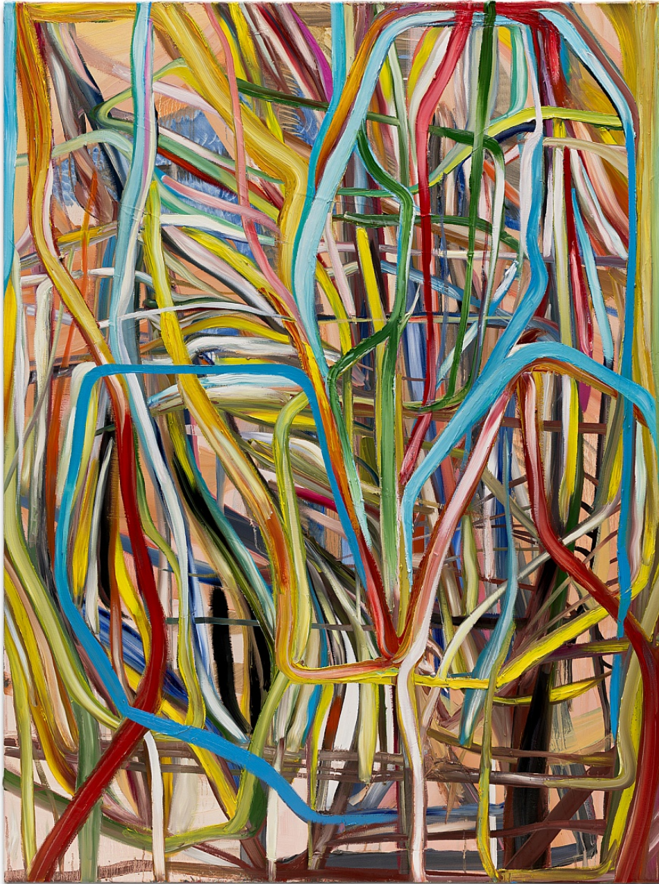
Tanya Ling Scutum (Shield) HABA 2022 Oil on canvas 48h x 36w in