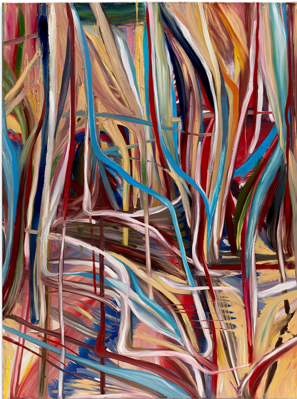
Tanya Ling Delphinus (Porpoise) HABA 2022 Oil on canvas 48h x 36w in